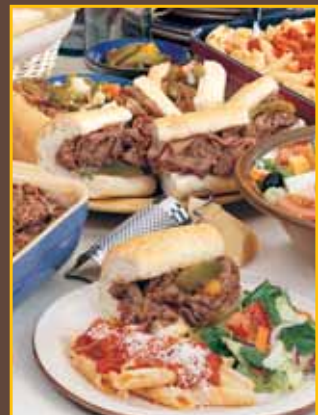
Party Rooms available at other Stores