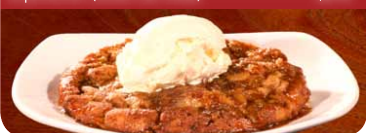
ALA MODE JUST $1.75

APPLE CINNAMON PANCAKE Freshly sliced Granny Smith apples with caramelized cinnamon-sugar. Baked to perfection (shown ala mode) . . . $8.45